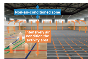
Design that can intensively air condition the activity area

YUKARELA, which is the cooling and heating system that comfortably and evenly air conditions the entire space by sending wind under the floor and cooling and heating the floor, is the all-air floor radiant cooling and heating system that can be introduced in a wide variety of facilities, such as childcare facilities, elderly facilities, apartments, and gymnasiums. By acquiring Kiyota Kougyo Co., Ltd., which is an air-conditioning equipment installation company, in April 2024, it became possible for us to not only expand our product lineup and receive orders for flooring work but also collectively propose industrial materials and construction, including air-conditioning design and construction. Since design that can intensively air condition in the activity area within a facility can be utilized for measures to prevent heat stroke and evacuation centers, we will put effort into adoption activities with a focus on the improvement of air-conditioning in gymnasiums.