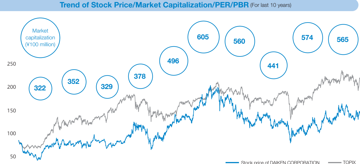
Stock price of DAIKEN CORPORATION

Note1: Total shareholder return: This expresses the total investment return for a shareholder that combines the amount of the stock price increase and dividend. Note2: Figures in the table above are calculated using the calculation formula by the Cabinet Office and are the values as of the end of each fiscal year from fiscal 2018 to fiscal 2022.