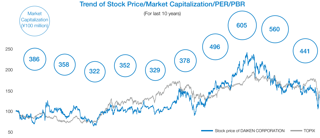
*Figures of stock price of DAIKEN CORPORATION and TOPIX are indexed, based on the data of closing prices on March 31, 2010.