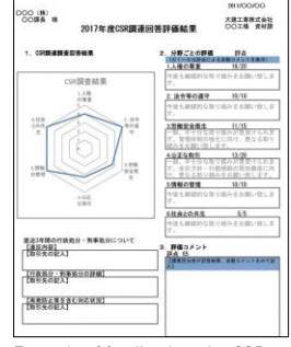
Example of feedback to the CSR questionnaire results