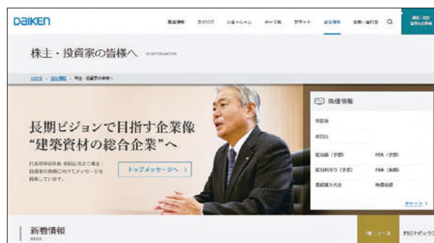
IR website page

In addition, as an informative tool for IR, the business performance information is highlighted to offer enhanced stock information. We will continue to actively utilize the website to disclose unbiased information to shareholders, investors and other stakeholders.