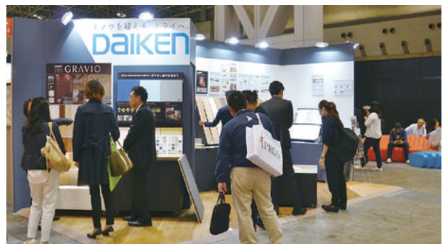
The Second Retail Premises and Facilities Exhibition

Moving forward, we will continue to actively propose products designed for public spaces and commercial facilities through exhibitions.