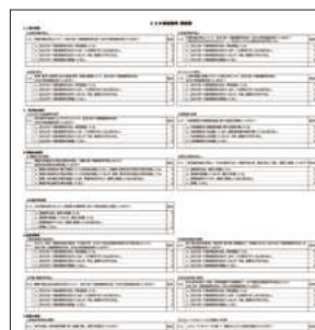
Sample of CSR questionnaire

We will continue to implement the survey to understand the actual condition to make improvements as part of our efforts to further promote CSR procurement.