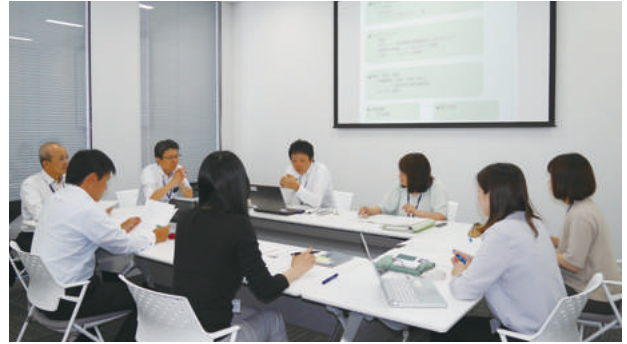
A review meeting for promoting women's active participation (Office: Workstyle change promotion preparatory office)

*Personnel working directly for the plant department and shift workers are excluded.