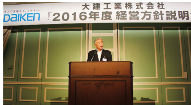
Management policy briefing session for fiscal 2017

In addition, on July 13, 33 companies were invited to the management policy briefing session at Hotel Granvia Okayama. The policy briefing sessions were also held by other departments all around the country.