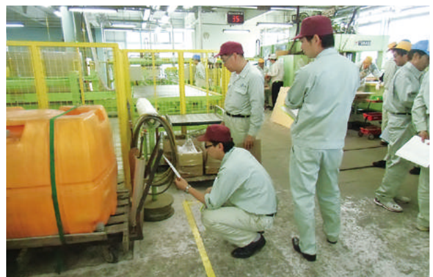
Worksite diagnosis for mutual safety checks

For fiscal 2017, Daiken sets key agendas of ensuring compliance with rules and improved worksite capabilities. The safety diagnosis was joined by worksite leaders, including unit head, shift leader and group leader, to focus on creating the structure of compliance with rules. For the future, Daiken is pledged to continue safety diagnosis according to challenges in worksites to create a safe workplace.