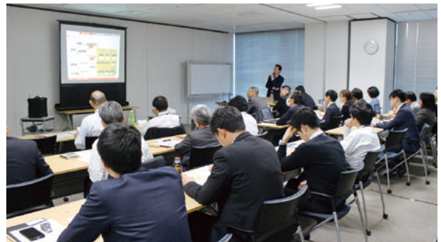
The fourth lecture for the Quality Assurance Department

In January 2017, external experts were invited to hold a lecture on the theme of adhesives, which are essential for building materials. Nearly 100 employees including those in charge of development joined to deepen their understanding about characteristics and assessment procedure.