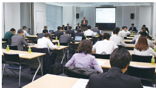
Presentations for financial results

In addition to holding annual meetings of shareholders (the end of June), Daiken Group holds presentations for financial results for investment analysts and institutional investors on a regular basis to explain about the outline of financial results and business plans. In addition, individual meetings are held quarterly by inviting institutional investors in consideration of mutual communication. Through direct dialog, we aim to reflect their expectations in our management.